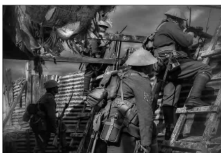
Poised to go over the top? German lines could be 200 yards away.