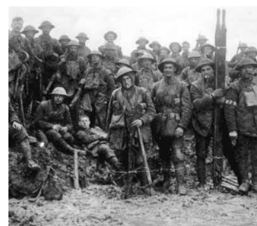
Men of the Manchester Regiment at Serre in France. Find out where Serre is.