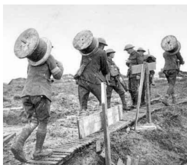
Telephone wire layers on the Western Front. Why are they walking on boards?