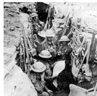
British troops entrenched on the Western Front.