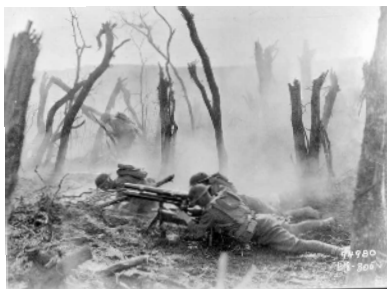
Machine gun crew amongst the shell holes of No Man's Land.