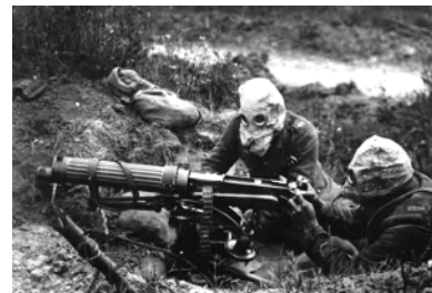
Battle of the Somme 1916. Note the early version of the poison gas mask.