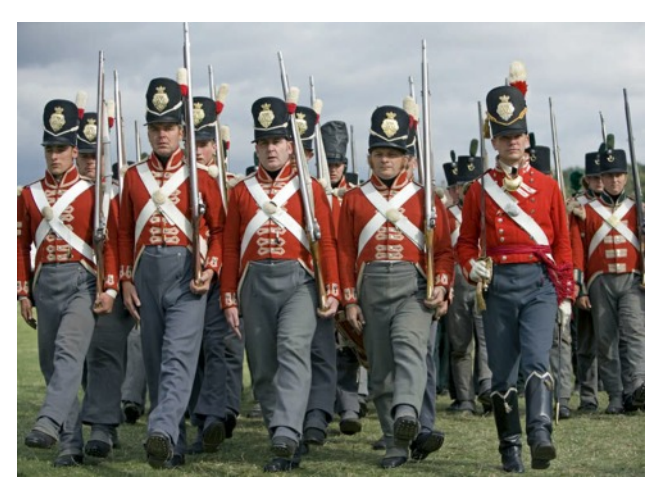
Early British army uniforms were usually brightly coloured.

Why was it later decided to change the uniform colour to khaki?