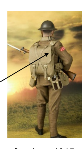
after June 1915